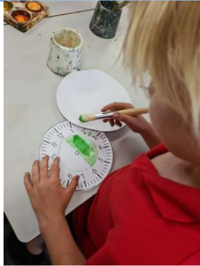
Buddy Time: working with a buddy we observed what we saw and sketched it