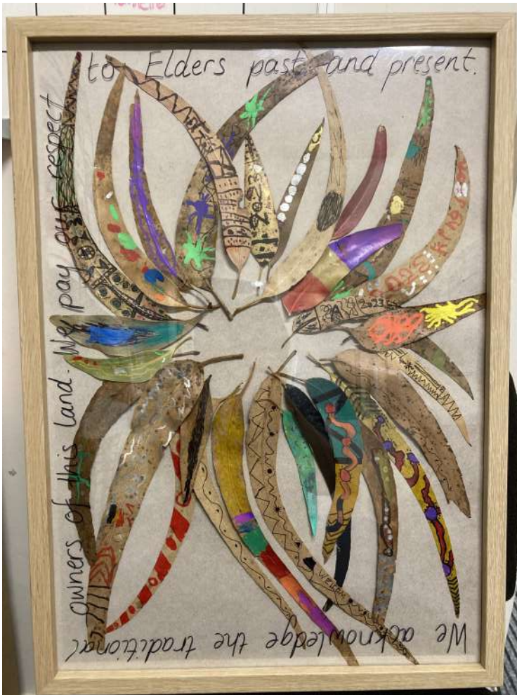
^ We made this beautiful collage as an acknowledgement of country.